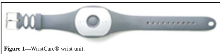
Figure 1 —WristCare® wrist unit.

s is the activity of the scored epoch; mean is the mean activity in the window of 7 epochs around the scored epoch; sd is the standard deviation of the activity in the window of 8 epochs around the scored epoch; nat is the number of activity counts above a given threshold in the window of 11 epochs around the scored epoch (the threshold was 1 for WristCare® and 10 for actigraphy); log2 is the natural logarithm of the activity during the scored epoch + 0.1.